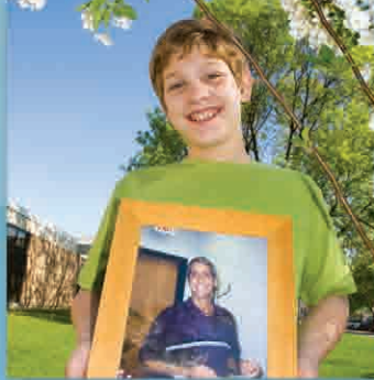
Mark Wood Foundation