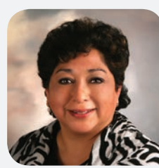
Mayuli Bales Diocese of St. Cloud