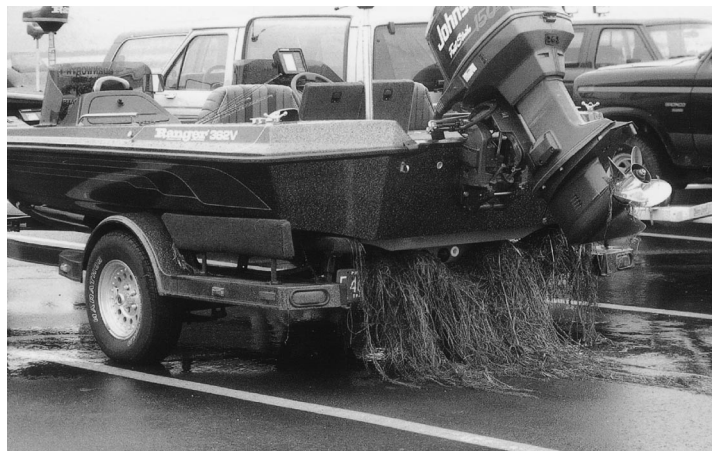
FIG. 1. An extreme example of the entanglement of aquatic macrophytes on recreational boats and trailers. The photograph was taken at the boat launch area of the Ensign Public Access Site, Lake St. Clair, Michigan, USA, in the summer of 1993.

On six dates in August, water was sampled from areas where it might accumulate or be stored on a boat. Typically 5 to 15 samples were collected on any given day from boats chosen haphazardly. These included samples from live wells (containers designed to keep