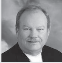
Reggie Clow Clow Stamping